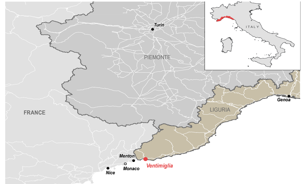
Map 1: The Italian-French border