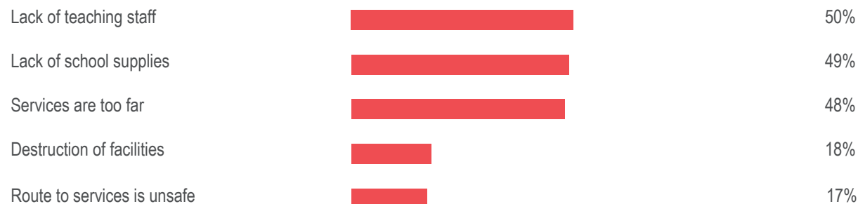
Prevalence of barriers to accessing education services:

523 communities reported that all children were able to access education. The most commonly reported barriers to education in the remaining 528 assessed communities were: 2,3,4