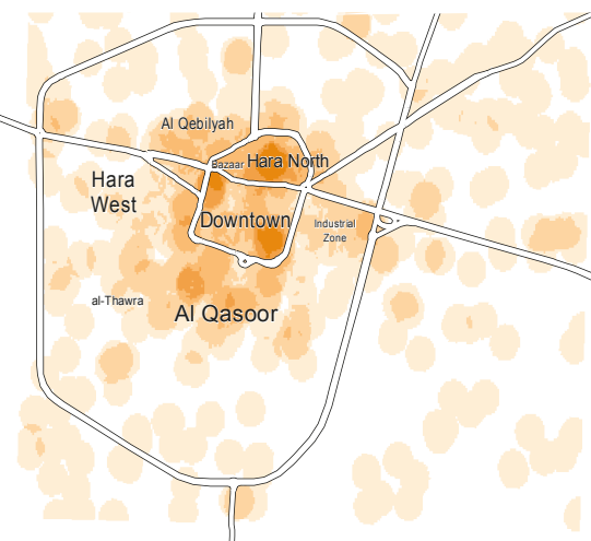
Imagery provided by: U.S. Department of State, Humanitarian Information Unit, NextView License - WV02 - Resolution 0.50 cm - Date: 19.04.2016 Shelter Damage Assessment Data: UNOSAT/REACH Projection: WGS 1984 UTM Zone 37N File: REACH_SYR_Damage_Assessment_Idleb_1Aug16_A3

Note: Data, designations and boundaries contained in this map are not warranted to be error-free and do not imply acceptance by the REACH partners, donors and associated persons mentioned in this map.