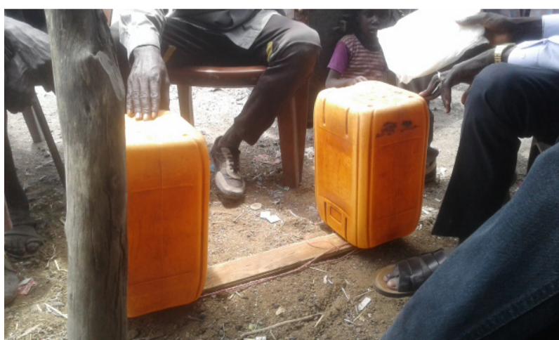
Figure 1: Demonstration of improvised flotation device for fishing during FGD with fishing group