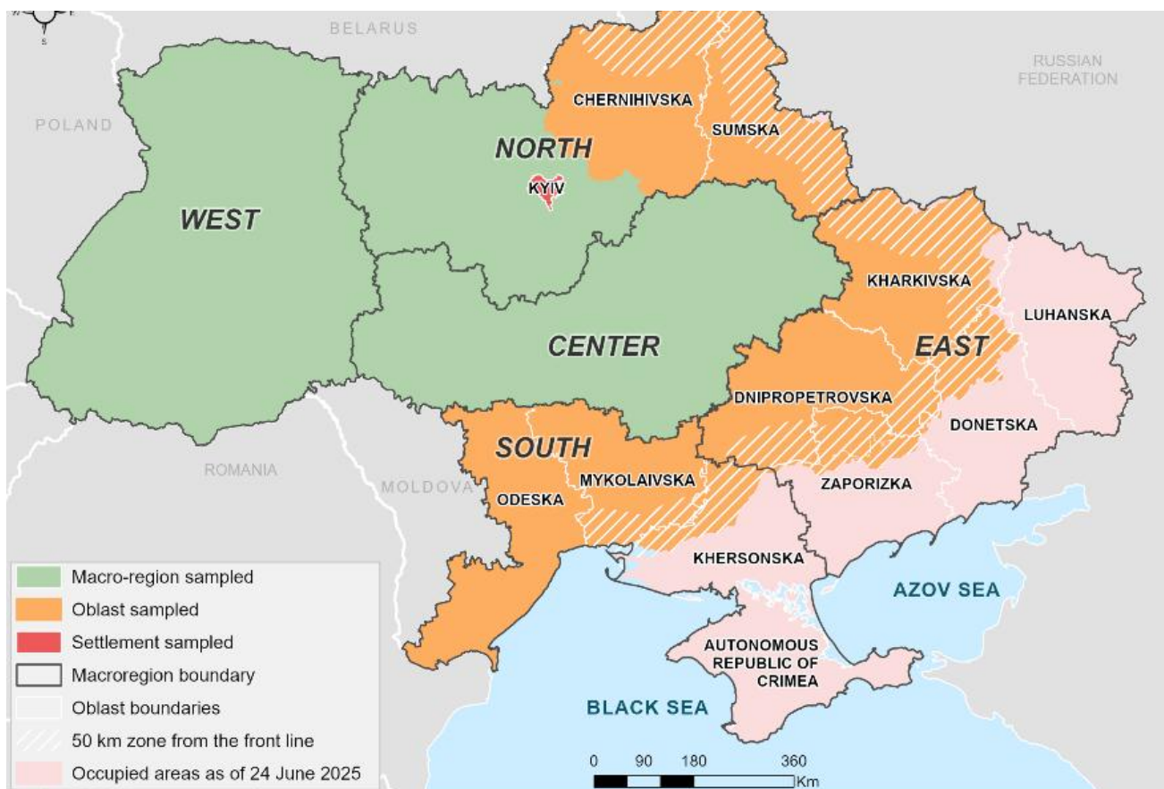
Map 1: Sampling approach

The sampling approach was representative at least at the 95% confidence level with a \pm 9\% margin of error. More details on data representativeness for each strata are as follows: